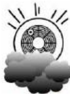
Fire Smoke Detector