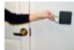
Excess Card Entry