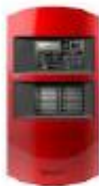
Fire Alarm System